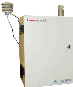
Thermo Scientific™ Partisol™ 2000i Air Sampler